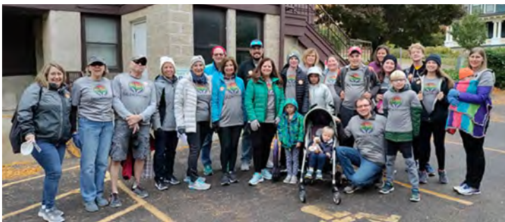
CROP Walk 2022: Team Salem

Last year, we had the largest Madison team with 24 walkers and raised about $1500. Help us surpass those numbers to make an impact.