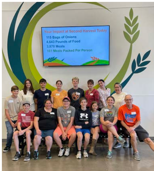
Heartland Second Harvest

52 people gathered on July 24 to share a meal together and hear about the youth SALT Trip to Minneapolis. It was a wonderful evening of reflection and testimony as the youth described the experience of confronting racism in our society, the value of fellowship with each other, and the importance of mixing fun with the hard work. Great job Salem youth! We are looking forward to SALT Trip 2024!