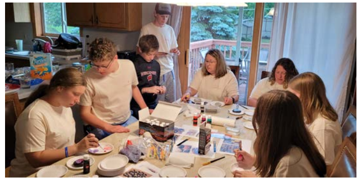
Making our offerings before our visit to George Floyd Square

September: Watch the Mighty Network for information about our youth kickoff gathering. We will use this gathering to review our calendar for the coming program year, discuss service opportunities, and plan some fun!