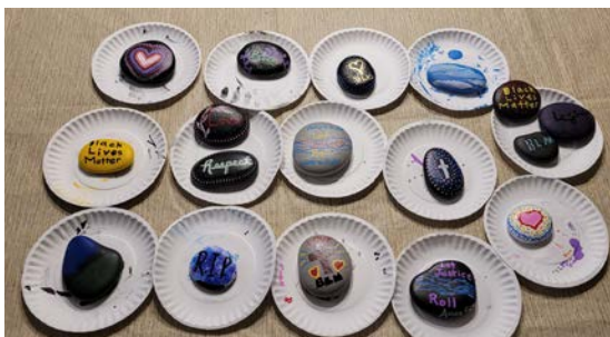
Offerings for George Floyd Square