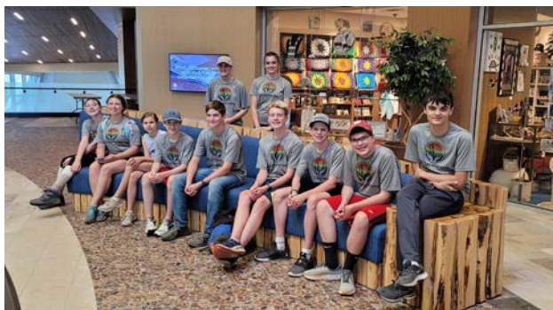
Mdewankanton: Spirit of the Dwellers Lake Exhibit