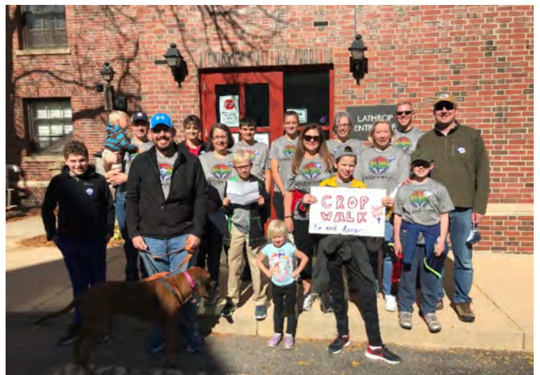
2021 Salem CROP Walk Team

Last year, Salem had the largest local team with 17 people and raised $1500. Can we top that this year? Please register and join the youth in their quest tackle hunger around the world.