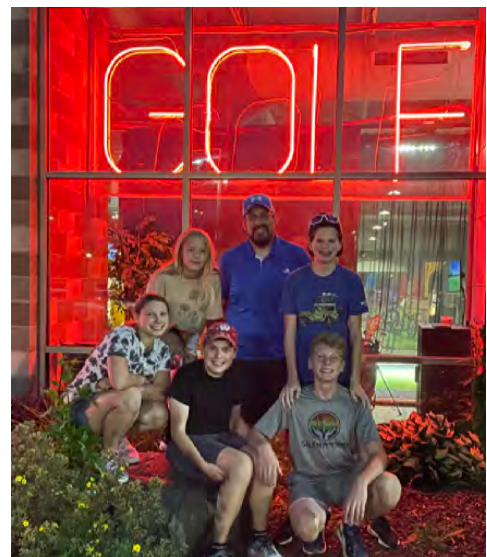
August mini-golf outing

We will discuss the upcoming program year including gatherings, activities, mission opportunities, Youth Sunday, and the next S.A.L.T Trip experience!